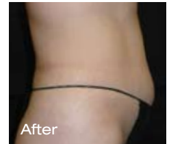
Post five treatments.